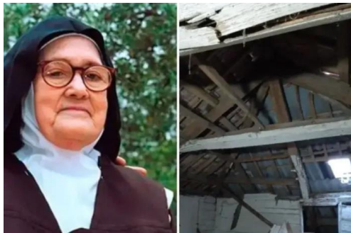
Sister Lucia, seer of Fatima (left); detail of the sanctuary of Pontevedra (right)