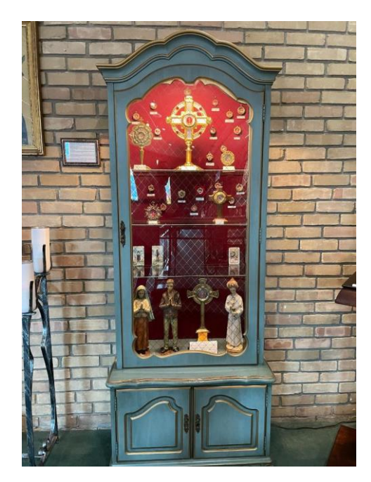
Reliquary with relics of the Fatima children and other saints for veneration at the Shrine.