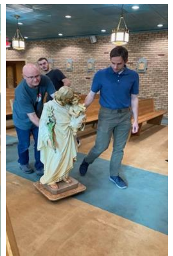
Good St Joseph, Thank You!