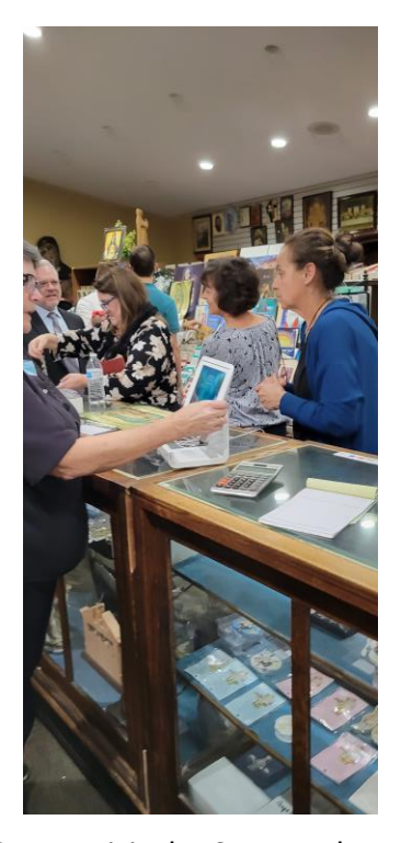
Guests visit the St. Joseph Book Store following the dedication Mass.