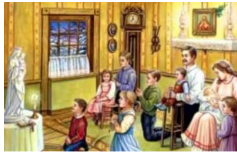
Chaste Heart of St. Joseph?

forgiveness? Does God's truth reign in our homes through consecration to the Sacred Heart of Jesus, the Immaculate Heart of Mary, and the