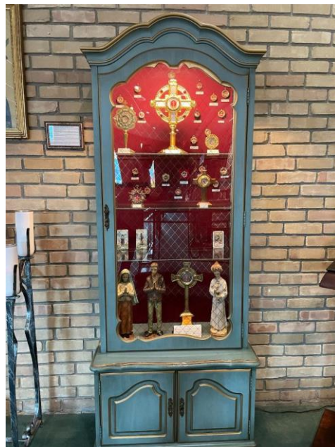
Reliquary with relics of the Fatima children and other saints for veneration at the Shrine.