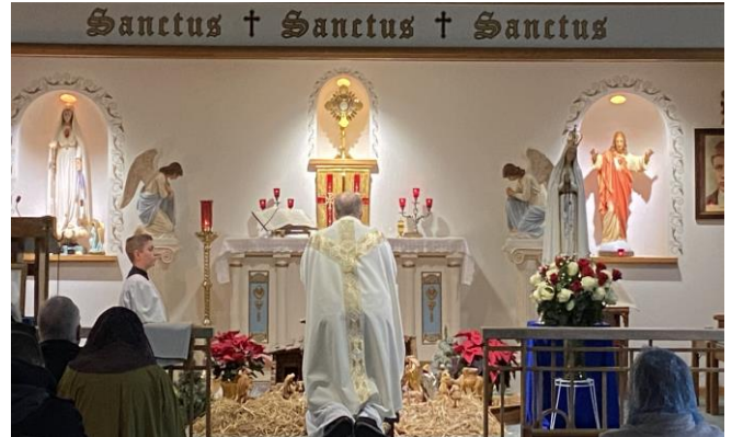
Four pictures from the first 1 st Saturday of 2023