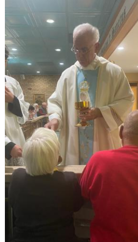
Celebrating October 13 th Mass.