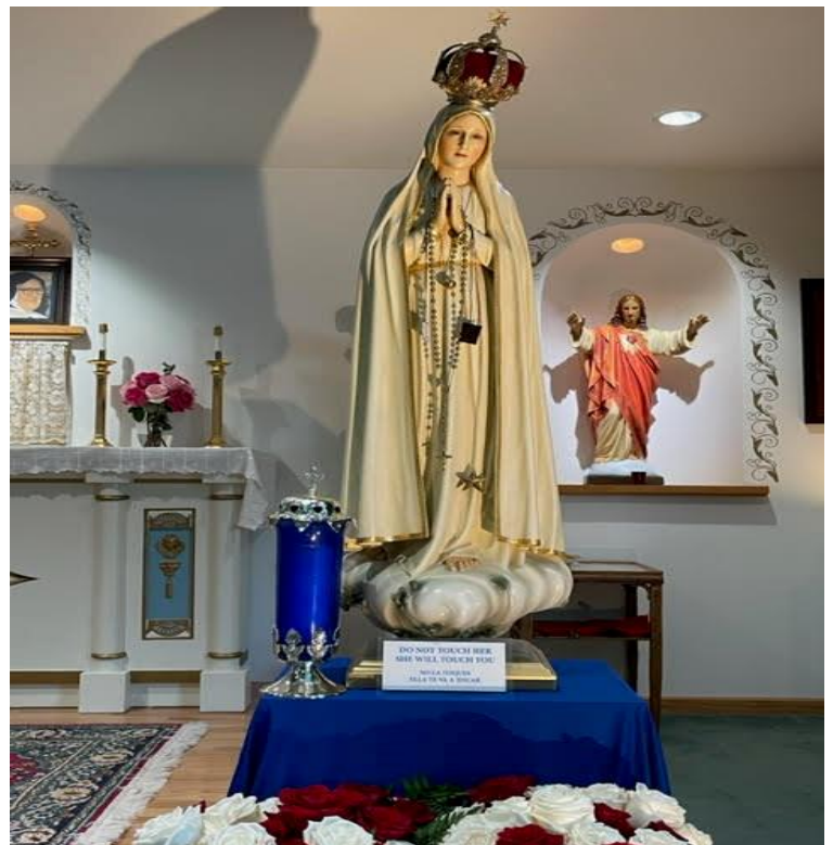
International Pilgrim Virgin Statue of Our Lady of Fatima visit on July 24, 2023